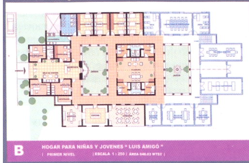
Architectural design of the Home "Luis Amigo"

Colabora con este sueño! Collaborate with this dream!